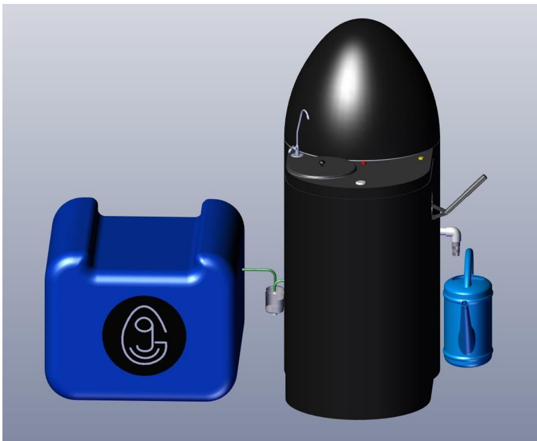
Figure 1: MyGug for Home showing: Gas Bag, MyGug and Watering can

MyGug Microscale Anaerobic Digesters are a complete disposal system for all types of food waste, cooked and uncooked. Through the process of Anaerobic Digestion food waste is turned into biogas and liquid bio-fertiliser.